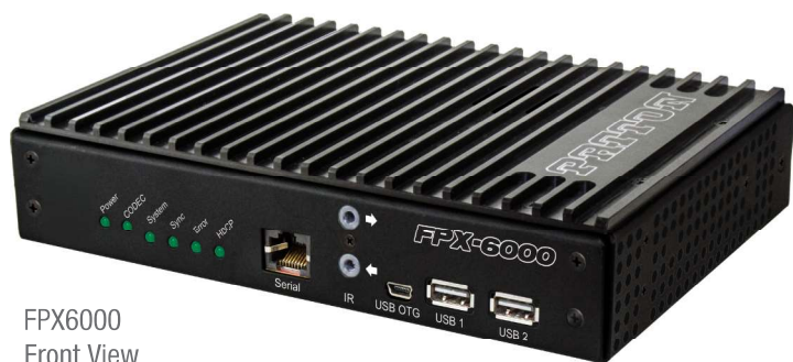
FPX6000 Front View