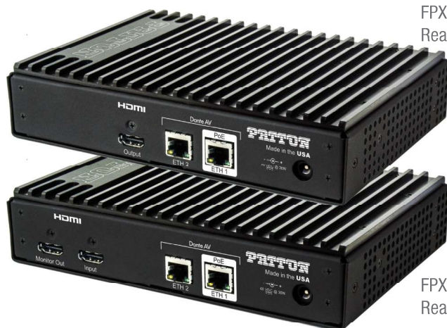
FPX6000R Rear View