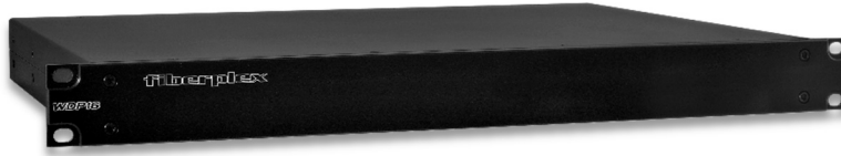
WDP16 Front View

The FiberPlex WDP is a rack-mountable passive 8 or 16 channel coarse wavelength division multiplexer. Unlike