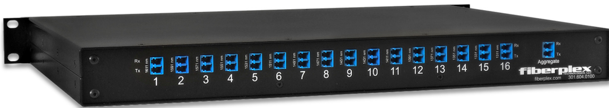
WDP16 Rear View